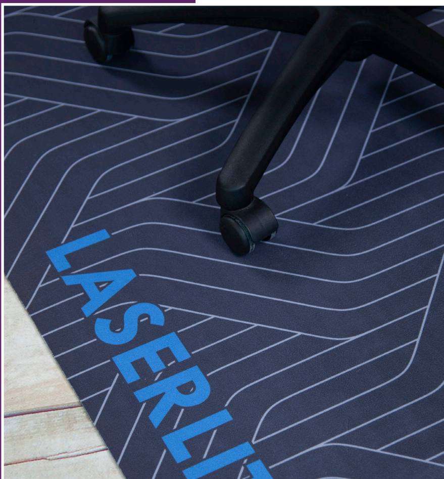
Product No. 32765